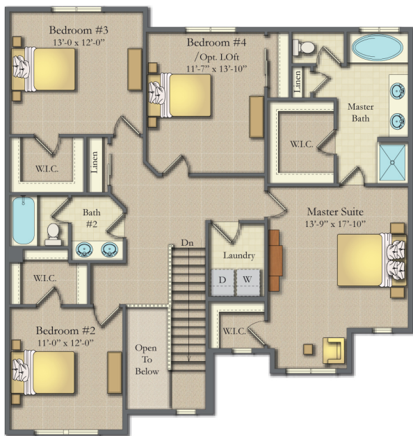
UPPER LEVEL 1,358 SQ.FT.