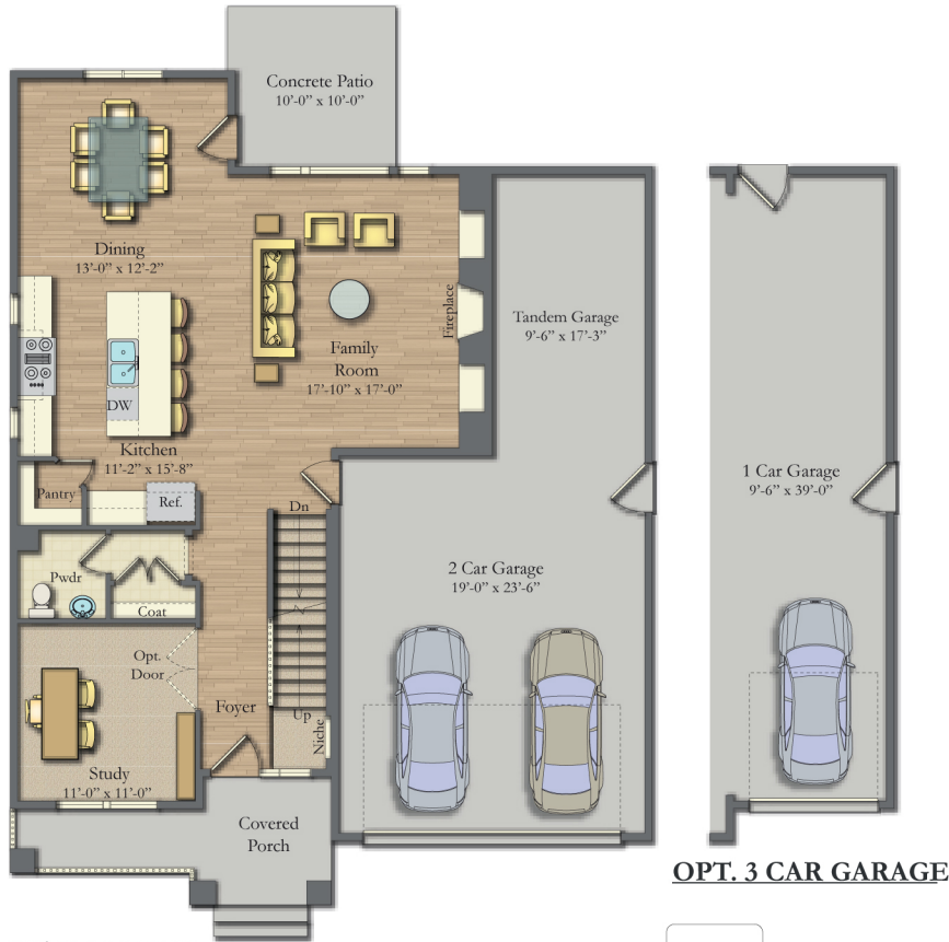
MAIN LEVEL 1,010 SQ.FT.

4 Bedrooms • 2.5 Bathrooms • 3 Car Garage 3,429 Total Sq.Ft. • 2,368 Finished Sq.Ft